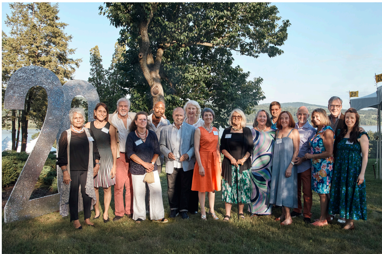
Thomas Cole National Historic Site Board of Trustees