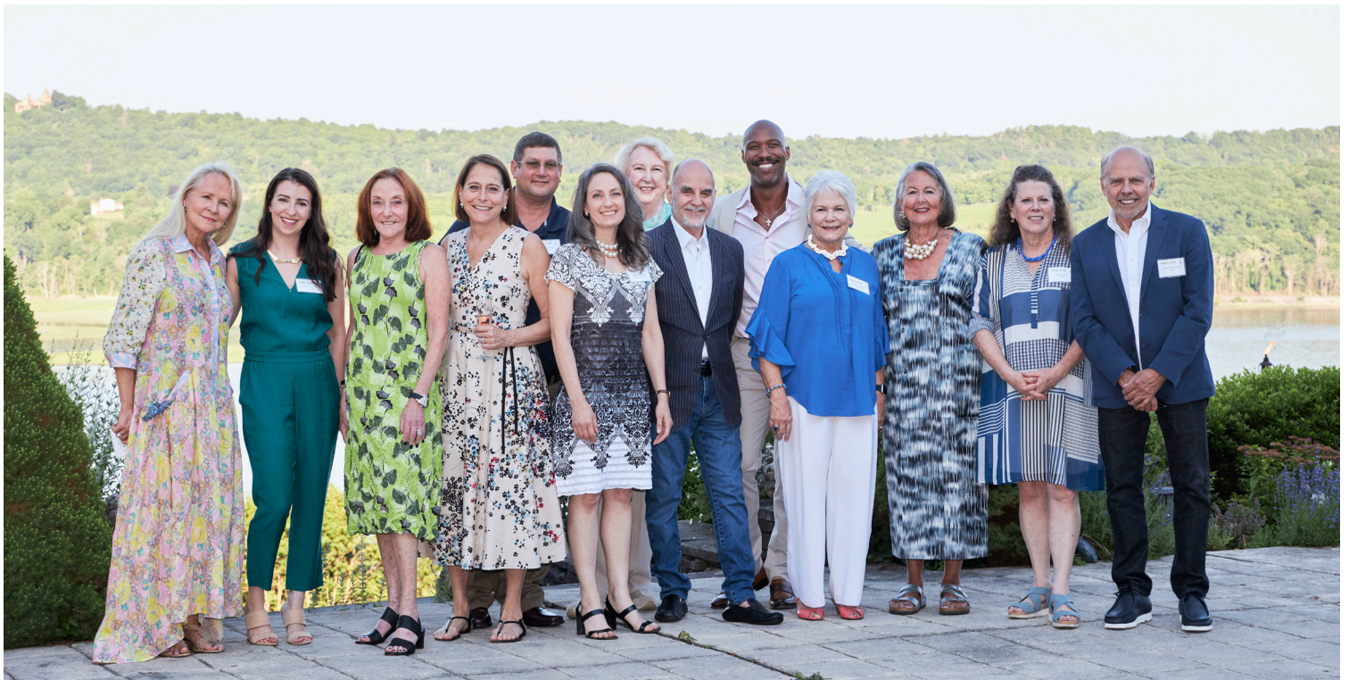
Thomas Cole National Historic Site Board of Trustees