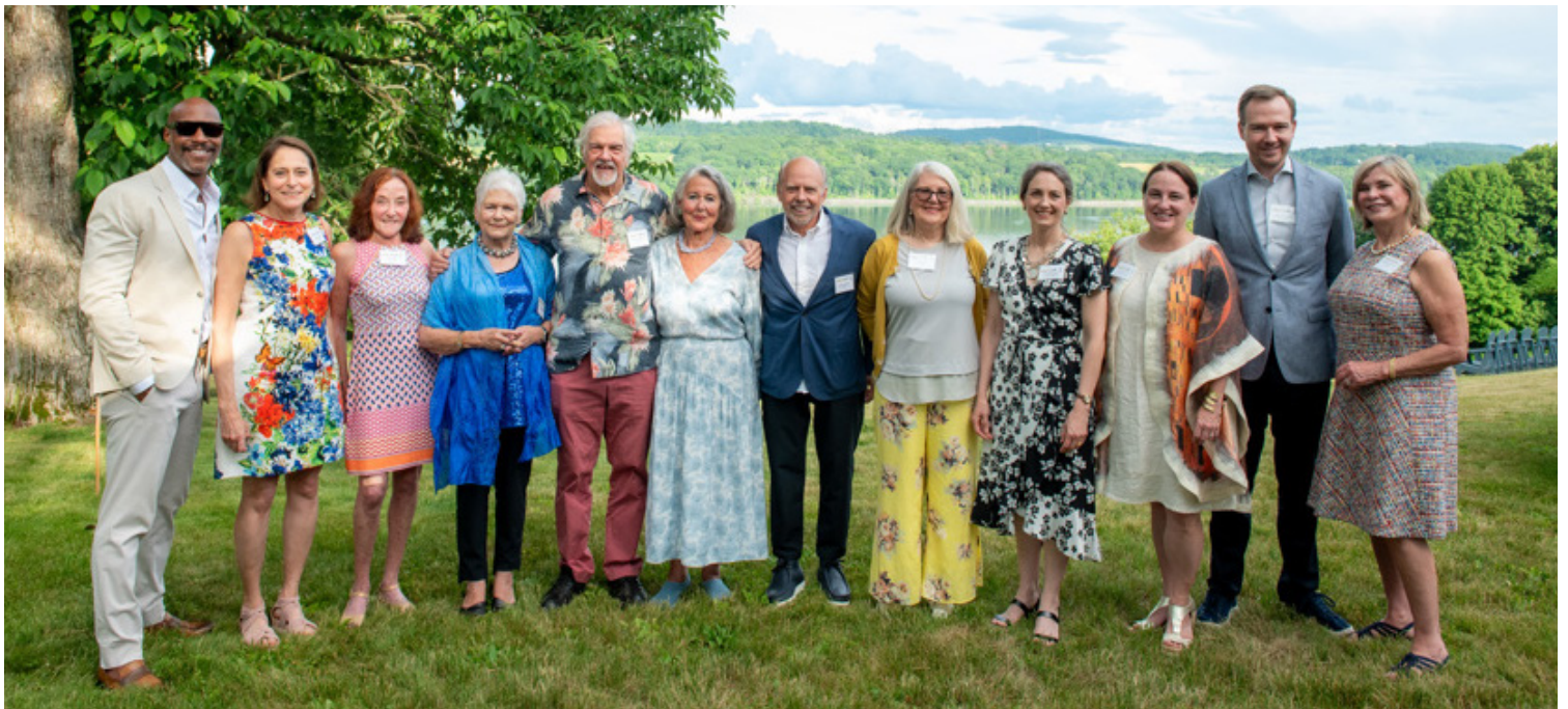
Thomas Cole National Historic Site Board of Trustees