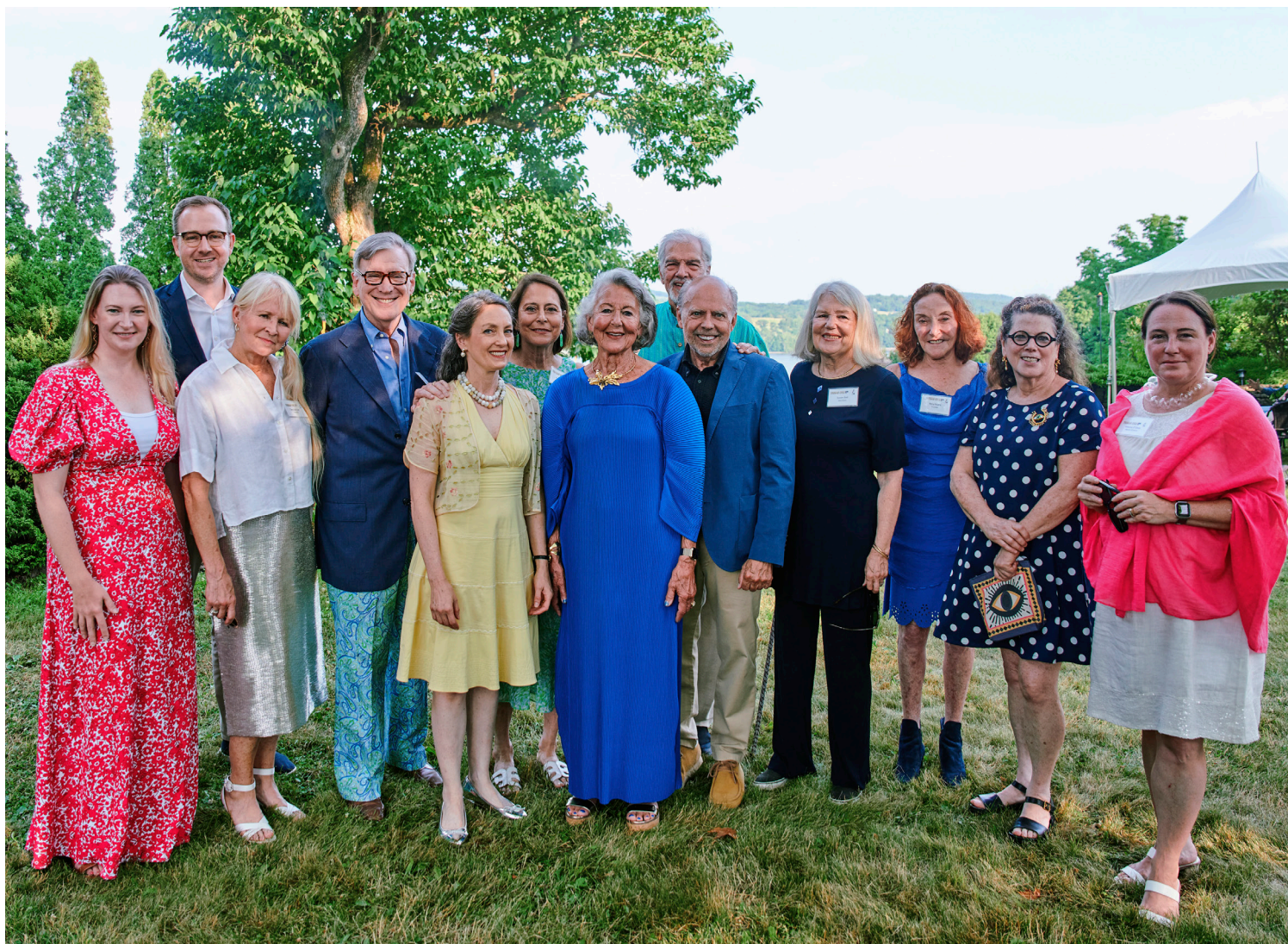
Thomas Cole National Historic Site Board of Trustees