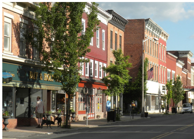
Catskill Main Street

Gracie's Luncheonette, 969 Main Street, Leeds N.Y. (Est. 1 min drive from Camptown)