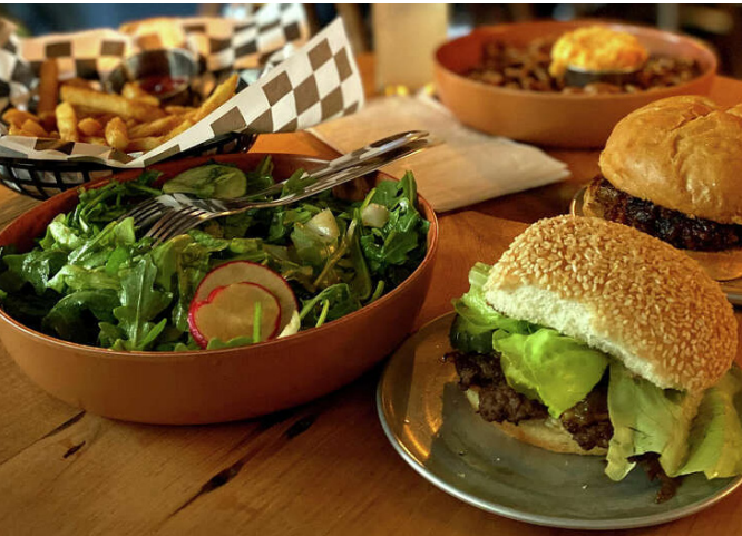
Cocktails at Hemlock

(Est. 13 min. drive from Circle W Market) Hudson River School Art Trail Sites #5 and #6 are both located off N. Lake Rd. and are approximately a 2-min drive apart.)