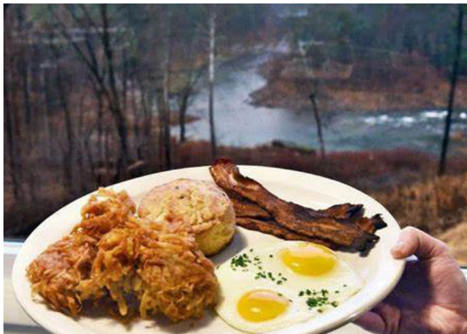
Brunch at Gracie's Luncheonette via Great Northern Catskills