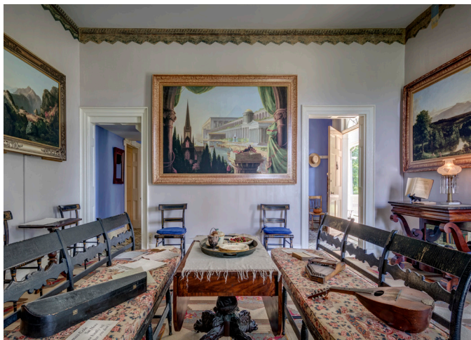
The West Parlor at the Thomas Cole National Historic Site

Take a weekend adventure to the home of the Hudson River School of American landscape painting on the 200th anniversary of the trip that changed American art forever.