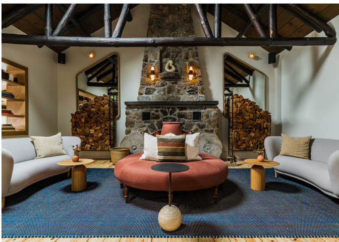
Camptown lobby

Hemlock, 394 Main St, Catskill, NY (Est. 29 min. drive from the Art Trail Sites)