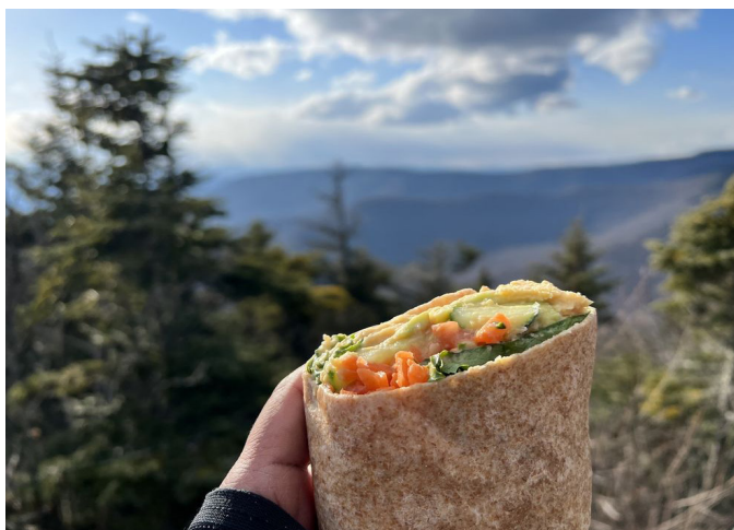
Wrap from Circle W

Circle W Market, 3328 NY-23A, Palenville NY (Est. 20 min drive from the Thomas Cole National Historic Site)