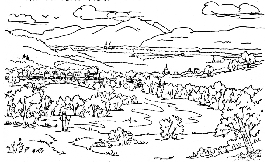
THE ACTUAL VIEW C. 1837