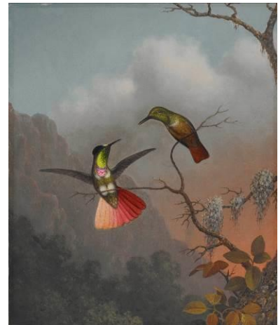
Martin Johnson Heade, Hooded Visorbearer , ca. 1863–64, oil on canvas, 12 1/4 x 10 in. / Framed: 18 1/4 x 16 1/2 in. Crystal Bridges Museum of American Art, Bentonville, Arkansas; 2006.93.

“Cross Pollination” was conceived in the Hudson Valley and created by the two historic sites and the Crystal Bridges Museum of American Art in Bentonville, Arkansas. The exhibition stems from the artist Martin Johnson Heade’s 19 th -Century series of hummingbird paintings, The Gems of Brazil (1863-64), and their unique relationship to the epic landscapes of Hudson River School artists Thomas Cole and Frederic Church, as well as their continued significance to contemporary artists working today. The exhibition positions these 19 th -century artists in a call and response with 21 st -century American artists, whose works engage contemporary issues related to biodiversity, habitat protection, and environmental sustainability. The contemporary artists are Rachel Berwick, Nick Cave, Mark Dion, Richard Estes, Juan Fontanive, Jeffrey Gibson, Paula Hayes, Patrick Jacobs, Maya Lin, Flora C. Mace, Vik Muniz, Portia Munson, Lisa Sanditz, Emily Sartor, Sayler/Morris, Dana Sherwood, Jean Shin, Rachel Sussman, and Jeff Whetstone.