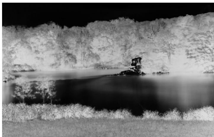
Shi Guorui, Catskill Creek, May 21 2019 , unique Camera Obscura Gelatin Silver print, 69 x 45 in.

Shi Guorui is internationally recognized for his giant camera obscura photographs. His projects have included panoramic images of the Great Wall of China, Shanghai, Hong Kong, New York's Times Square, and Mount Everest. His work has been featured in exhibitions at The Metropolitan Museum of Art in New York, the de Young Museum in San Francisco, The Museum of Fine Arts in Houston, TX, and the Museum of Contemporary Photography in Chicago, among other museums in North America, Europe, and Asia. He is represented by 10 Chancery Lane Gallery in Hong Kong. Originally based in Beijing, China, Shi Guorui now has a studio and home in Catskill, New York.