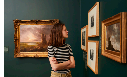
NEW STUDIO

Do you know I am something of an Architect?