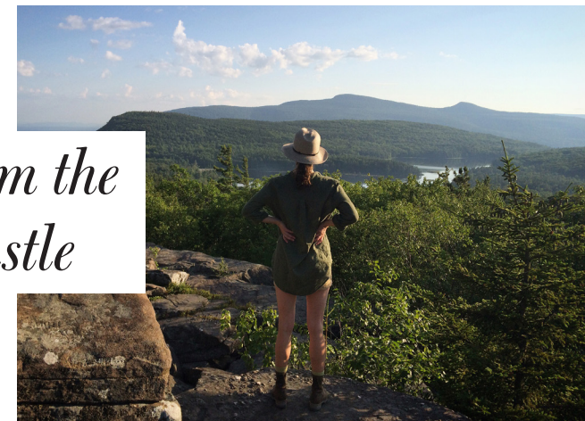
SUNSET ROCK

Step into a landscape painting with the Hudson River School Art Trail. Take a road trip to see the places in nature that Thomas Cole and his fellow Hudson River School artists painted throughout the Hudson Valley. Plan your adventure at hudsonriverschool.org .