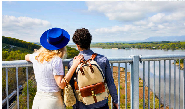
Rip Van Winkle Bridge and cover photo by Zio & Sons

The Thomas Cole National Historic Site is located in the village of Catskill, New York, at the foot of the Catskill Mountains in the Hudson Valley. The historic site is just off the Rip Van Winkle Bridge and is a ten-minute car ride from the Hudson Amtrak station.