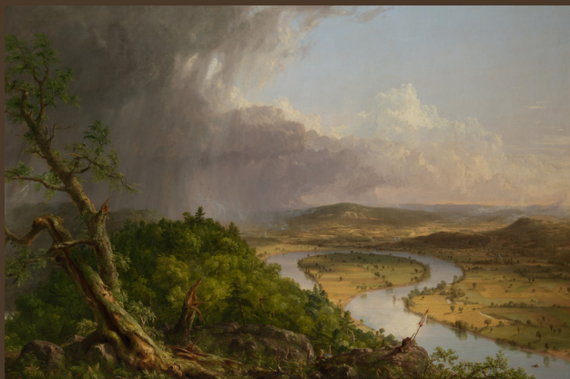
Thomas Cole, View from Mount Holyoke, Northampton, Massachusetts, after a Thunderstorm - The Oxbow , 1836, The Metropolitan Museum of Art

I cannot but express my sorrow that the beauty of such landscapes is quickly passing away.