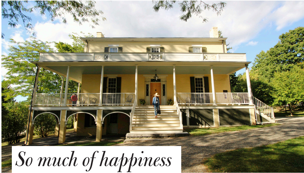
MAIN HOUSE, PHOTO BY ESCAPE BROOKLYN

So much of happiness in that little spot