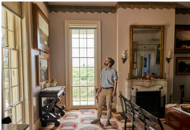
WEST PARLOR

In 1836, Thomas Cole wrote, “I often look at our house and think how wonderful that so much of happiness should be comprised in that little spot.” Cole designed the interior of the 1815 Main House, and today the restored Parlors feature the artist’s original decorative painted borders, and immersive digital storytelling installations. Watch as paintings seem to come to life on the walls around you and Cole’s private letters magically appear on desktops.