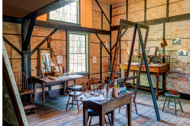
OLD STUDIO

Explore Cole’s 1839 Old Studio where he painted many of his greatest works. He wrote, “being removed from the noise & bustle of the house is really charming.”