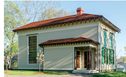
OLD STUDIO