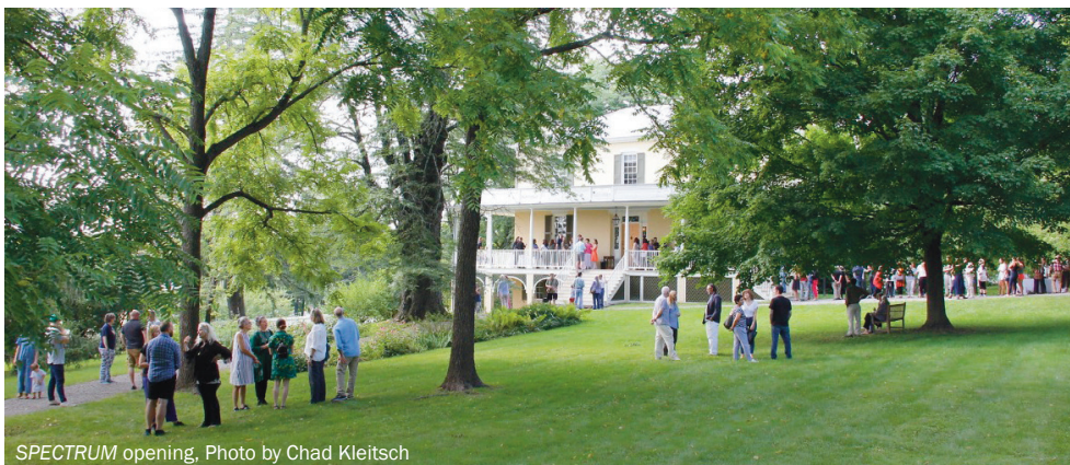
SPECTRUM opening