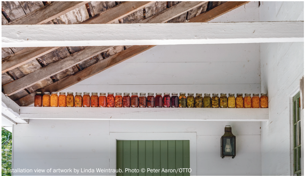
Installation view of artwork by Linda Weintraub.