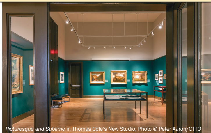
Picturesque and Sublime in Thomas Cole's New Studio